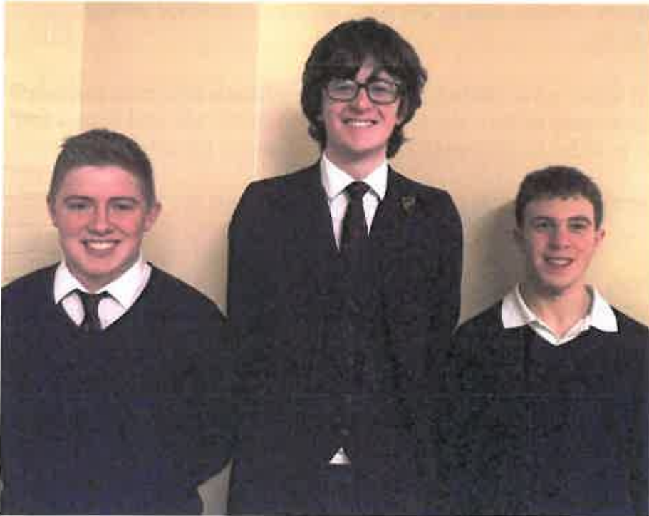
Oxbridge Year 12 AS Level pupils took part in an Oxbridge application preparation day in Carmarthen.

A2 is a one year course taken in Year 13 and it forms the second half of the full A level, AS + A2 = full A level Award. You cannot therefore study an A2 without first having successfully completed the AS in Year 12. In addition the A2 course places further demands on students in terms of the depth of understanding that students must demonstrate. Again this one year course will consist of two or three modules in each subject which are examined at the end of Year 13. The grade range for a full A level is A* to E, all pass grades, and a grade U.