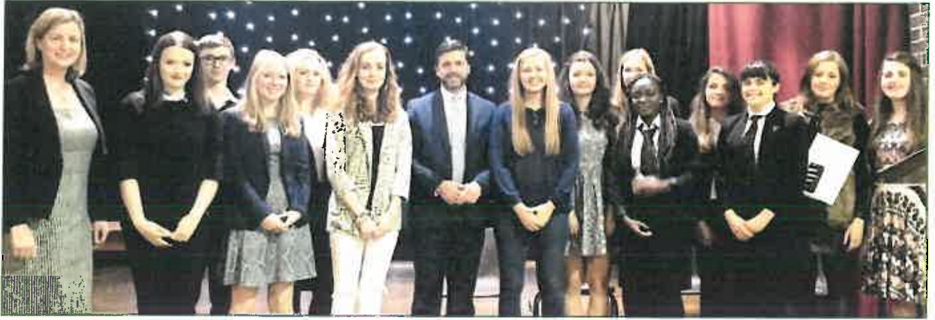
Our Celebrating Success Evening with guest speaker and past pupil Stephen Crabb.