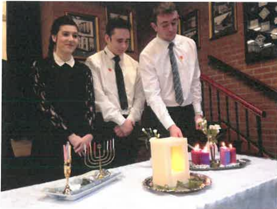
Senior prefects light candles to remember The Holocaust at Haverfordwest's memorial service

Students are expected to set an example to the younger years at all times and uniform is a key expectation. The uniform for sixth form is black and white business dress. Students either wear a white school polo shirt or a white shirt and school tie. Black blazers and jackets are a popular choice of many students. Full details of the uniform are available in the student diary.